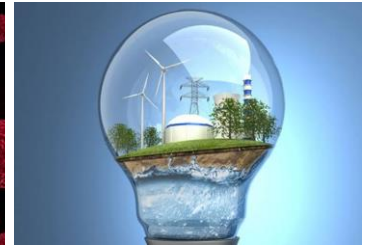
PROVIDING SUSTAINABLE ENERGY