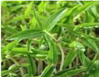
TRANSFORMING AGRICULTURE AND FOOD SECURITY

Harnessing Nanotechnology for Sustainable Development in Energy, Water, Health and Agriculture