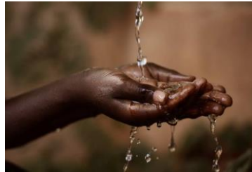
PROVIDING CLEAN WATER